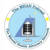
Mental Health Advocacy Network Podcast