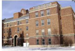
New Schulte Study